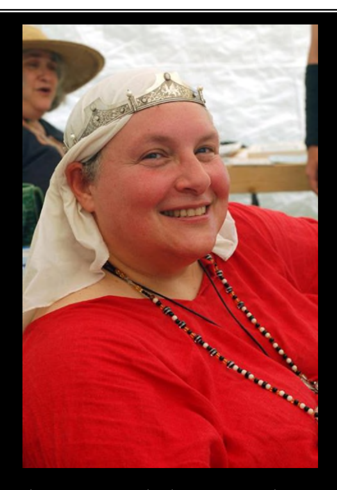
Viscountess Eleshava Bas Riva OL, OP, Baroness of the Court